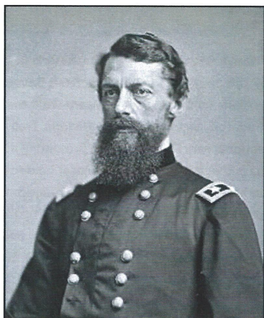
Maj. General George Stoneman

This is a free event to the public with donations always appreciated.