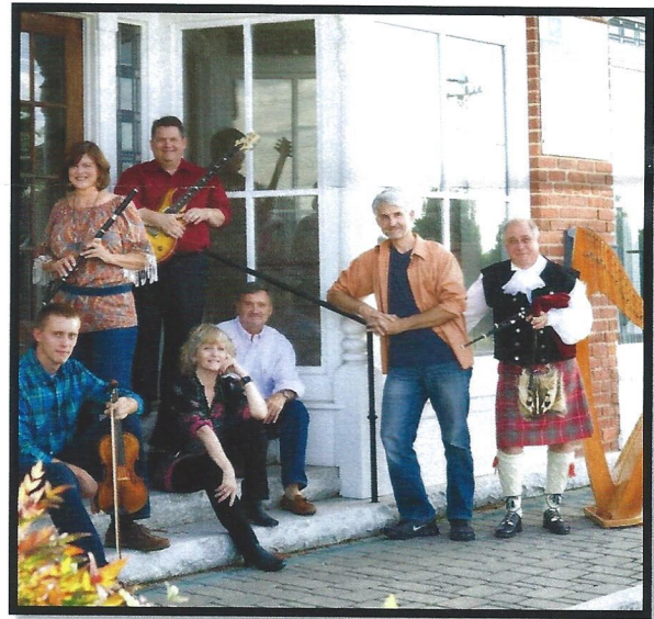
Puddingstone Performing at 5:00 pm

The Board of Directors at Fort Defiance invite the public to a Open House and the first Annual Celtic Festival held on Saturday, November 4, 2023 from 2:00 pm to 6:00 pm. The four groups playing are well known performers and very popular musicians from our area. The afternoon will be filled with music, food and history. Bring a chair and plan to spend the afternoon in the Yadkin Valley known to many as "The Happy Valley"